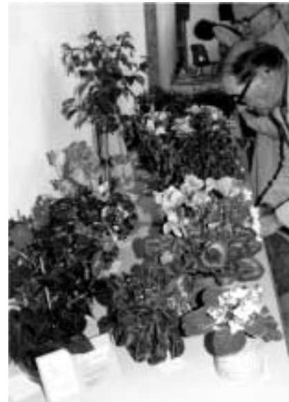
Finmere Horticultural Show, 1985

The show has not been held since 1998. Although the number of entries had not fallen, fewer families were taking part and little new interest and support was being shown.